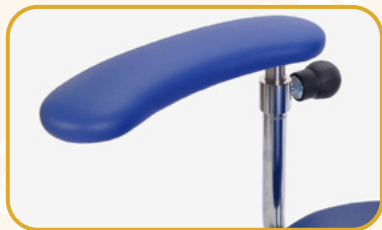
SWIVEL AND HEIGHT ADJUSTABLE ARMREST