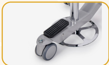
HEIGHT ADJUSTMENT RING MECHANISM